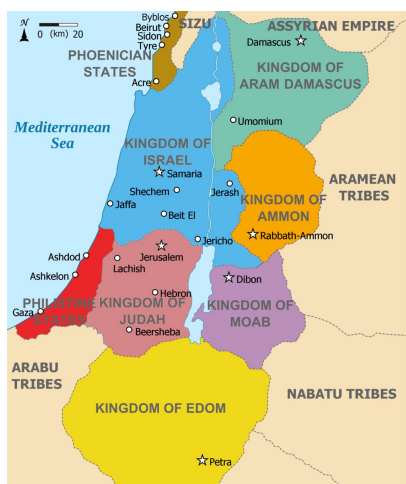
Philistines on West, Arabs on South

Then - This is a time phrase that describes the beginning of the reaping of the rotten fruit that Jehoram had sown. I am reminded of the description in Hosea 8:7 which says "they sow the wind and they reap the whirlwind." Notice two points - (1) whirlwind is worse than wind! (2) there is a delay between the sowing and the reaping, but in the absence of repentance, the reaping is certain! WOE!