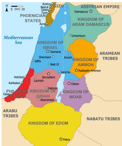
Edom Directly South of Judah